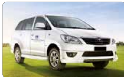
Large Vehicle Toyota Innova