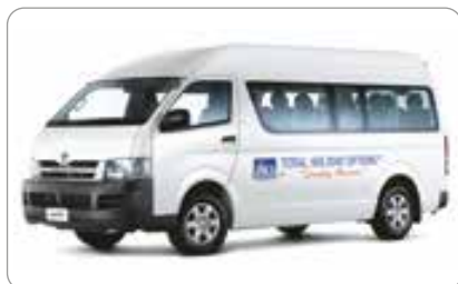
Micro Van Toyota Hiace