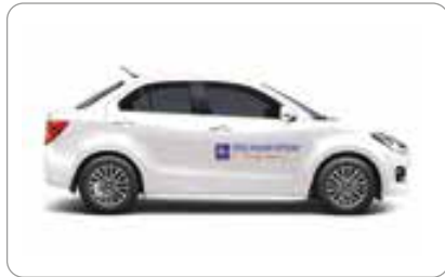
Medium Vehicle Suzuki Dzire

As per availability Vehicle's type, model and brand may vary. Thorough cleaning of your vehicle is done before it arrives in the morning to ensure the highest standards of hygiene are maintained. In national parks and sanctuaries, safari vehicles are used.