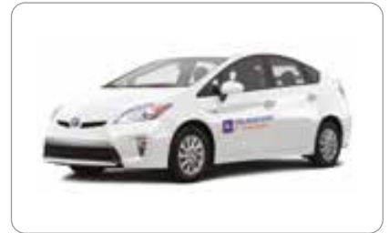
Medium Vehicle Toyota Prius