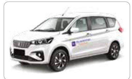
Large Vehicle Suzuki Ertiga