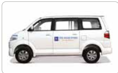
Medium Vehicle Suzuki APV