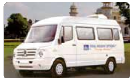
Mini Coach Tempo Traveller