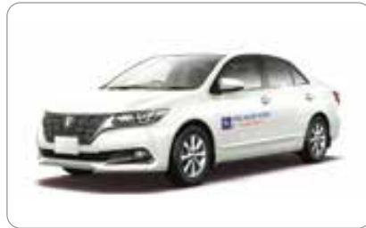
Medium Vehicle Toyota Premio